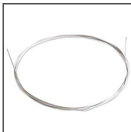
WIRE CU FI 0,95 mm Z70240