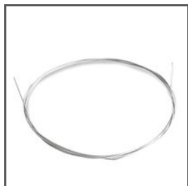
STAINLESS STEEL WIRE FI-1 1m C24522N00