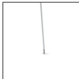
ROD PUSZ-ALU C28272A, C28272A07